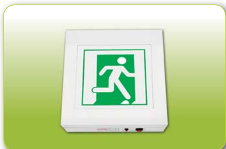
"CRYSTALITE" Cat. CX-LED-165-B