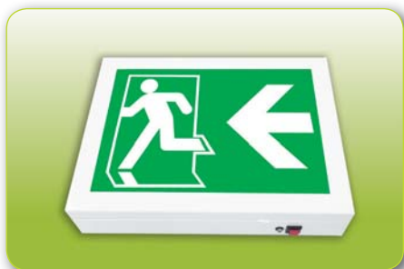
"CRYSTALITE" Cat. CX-LED-220-B